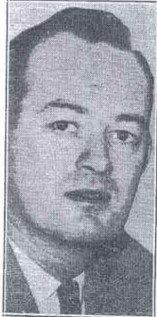
William Manchester Illness stalls negotiations

chester had a similar attack three or four weeks ago while travel-