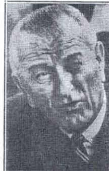
President Johnson Silence is order of day