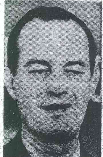
"... a perplexing affair . . ."