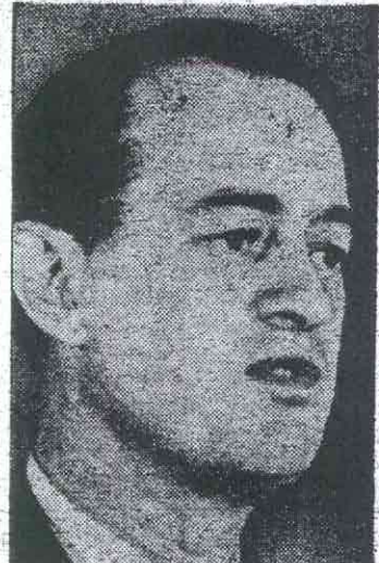
"One cannot always be sensible . . ."