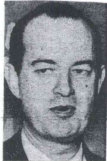
"She found no distortions . . ."