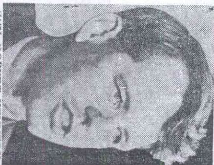
SEN. ROBERT KENNEDY Flying to Europe.