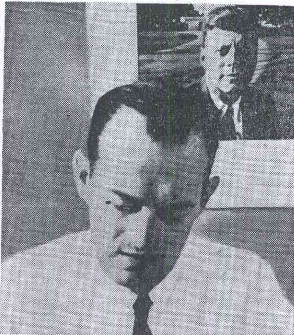
WILLIAM MANCHESTER , author: "I believe every reader . . . will find here much which is new and some, perhaps, which is disturbing."