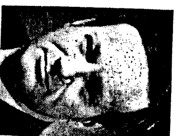
FRANK MANKIEWICZ 'Most plausible theory.'