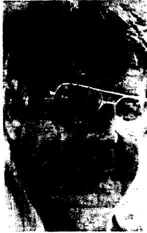
Billie Sol Estes