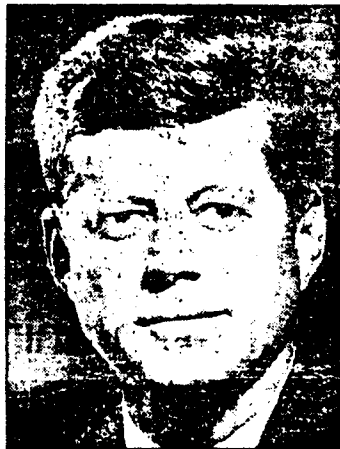
JOHN F. KENNEDY Momentous crime