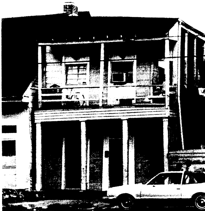
2011 Melpomene, scene of the "diversionary fire," on May 31, 1986.