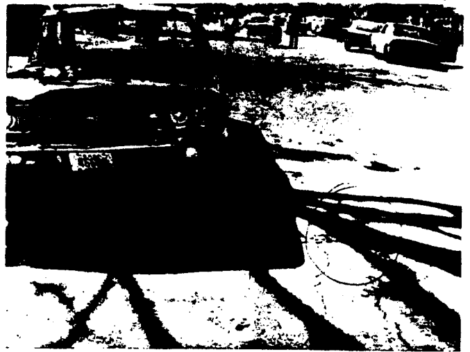
14. FRONT OF TIPPIT SQUAD CAR AT KILLING SITE.