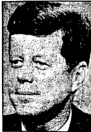
John F. Kennedy

● Did organized crime plot and carry out the murder of one or both of the Kennedy brothers?