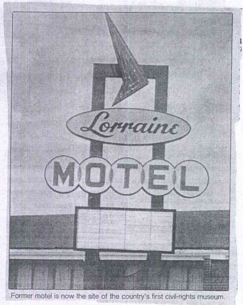
Former motel is now the site of the country's first civil-rights museum.

The layout focuses on vignettes of key events in the civil-rights era, starting with the U.S. Supreme Court's Brown vs. Board of Education of Topeka desegregation ruling in 1954, and ending with a view of King's motel room restored to its appearance on April 4, 1968. A preparatory exhibit covers black activism before the 1950s, while a final