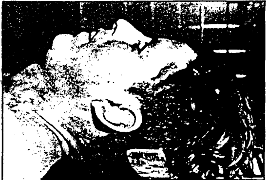
Damage to the rear of the skull is evident where the bullet exited