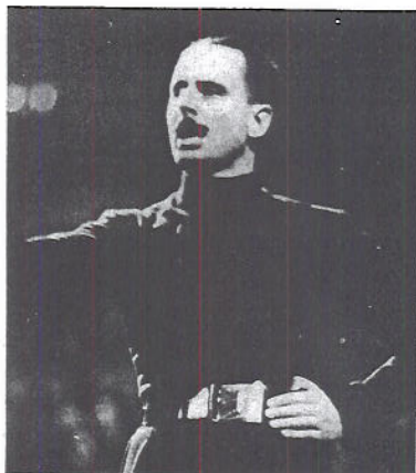
Sir Oswald Mosley European