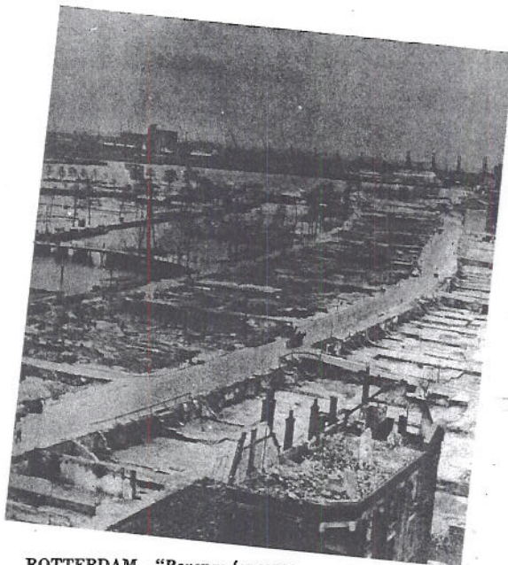
ROTTERDAM—"Revenge for senseless resistance," the Germans said.

On April 9, 1940, the German army invaded Norway.