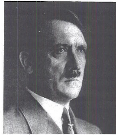
Adolf Hitler European

Lindbergh has been following the Nazi propaganda line in his speeches and writings for the simple reason that in most matters he agrees with the world's leading Nazi theorists. His statements reproduced on this and the next page are identical in thought, and sometimes identical in phrasing, to those of Adolf Hitler, Sir Oswald Mosley and Lawrence Dennis. Mosley was the leader of the British Union of Fascists and National Socialists until he was imprisoned for attempting to block the British defense effort. Lawrence Dennis is the leading theoretician in the American Nazi movement. Two of his books, The Coming American Fascism and The Dynamics of War and Revolution , are used as textbooks by American Nazis. As these comparisons show clearly, either Lindbergh is a spokesman for Nazism, or he is the victim of the greatest coincidence in the history of the world.