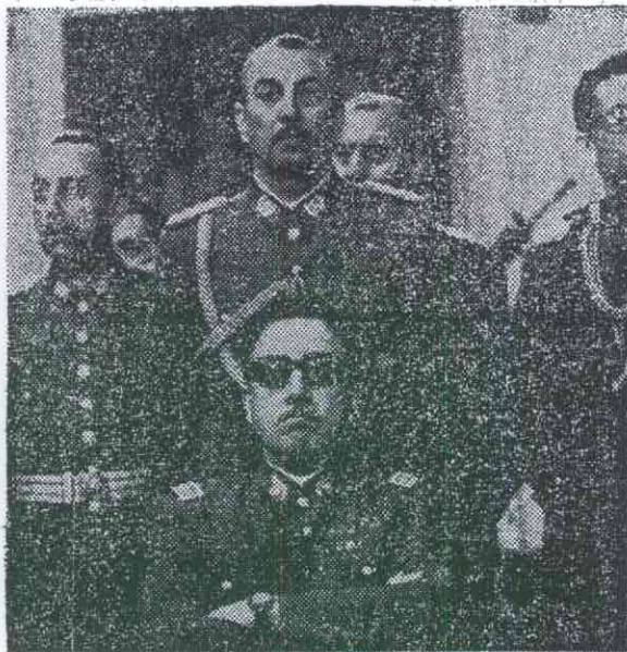
ORLANDO LETELIER (left), PINOCHET (seated) WITH HIS GENERALS