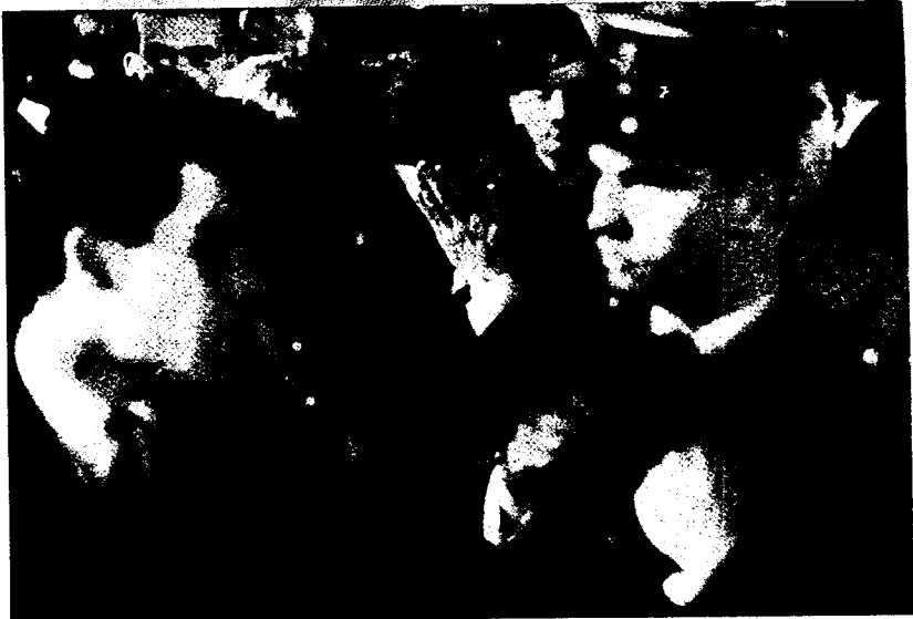
SHAKEN FRENCH. A young Parisian claps a hand to his face as others discuss news with agitated policeman. In London, the great bell of Westminster Abbey tolled for an hour—a thing normally never done for any one but the dead of the royal family.