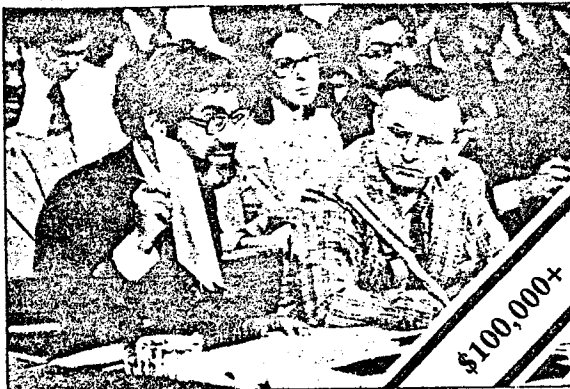
With James Earl Ray: Lane pushed Ray to testify before the House Assassinations Committee. They were demolished.