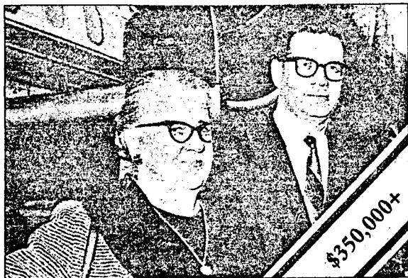
With Oswald's mother: Less than a month after the assassination, Lane gave a 10,000-word brief to the new Warren Commission.

His antinuke gig didn't make headlines. Kennedy's death did. Within weeks, Lane had corralled Oswald's mother as a client.