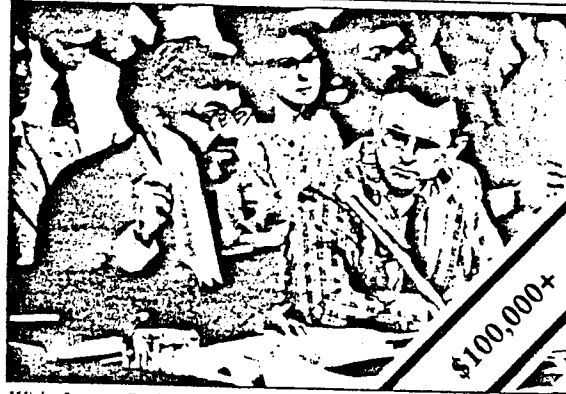
With James Earl Ray: Lane pushed Ray to testify before the House Assassinations Committee. They were demolished.