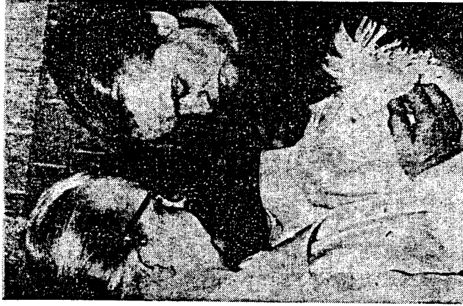
OSWALD'S FAMILY AT THE POLICE STATION. Mother, Marguerite, with wife, Marina, and baby months . . . I'm convinced that anyone else would be worse." (New York Times, Dec. 11)

I kind of took a liking to him." (New York Times, Nov. 24.)