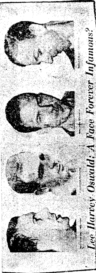
Lee Harvey Oswald: A Face Forever Infamous?

It would seem that the Secret Service move was dictated by a desire to prevent any truthful leaks from Mrs. Oswald's family or friends or through the press in reference to her views. At about the same time more Secret Service and FBI "leaks" regarding Marina Oswald's recollection of her late husband's "attempt to shoot Gen. Walker with the same assassination rifle" flooded the front pages of every daily in America. Marina Oswald's assertion that she never even knew