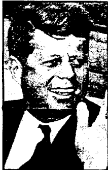
JOHN F. KENNEDY... Who really killed him?

In the three-year period that followed the murder of President Kennedy and Lee Harvey Oswald, 17 witnesses interviewed by the Dallas police, the FBI or the Warren Commission died: six by gunfire, three in motor accidents, two by suicide, one from a cut throat, one from a karate chop to the neck, three from heart attacks, and two from 'natural' causes.