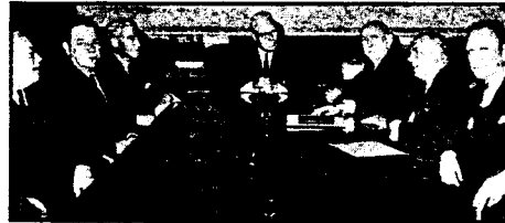
The Warren Commission's report on the JFK assassination is now considered a "whitewash" by most experts. A coroner who studied the evidence and others who have looked more closely into the murder of JFK are convinced beyond a doubt that a lone assassin could not have been responsible for killing the President