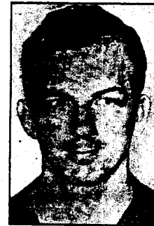
Lee Harvey Oswald ... a bum rap?