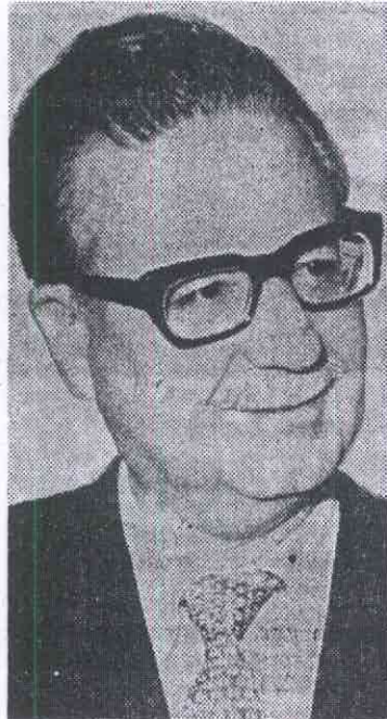
From left: Gen. Roberto Viaux, held back by Washington; Chilean President Salvador Allende; former Ambassador