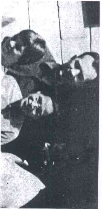
"Reverend" Ralph D. Abernathy (r) training at the Communist Highlander Folk School in 1957.

Committee finds that the Southern Christian Leadership Conference [now headed by Abernathy] . . . is substantially under the control of the Communist Party through the influence of the Southern Conference Educational Fund and the Communists who manage it."