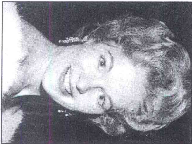
PEGGY CUMMINS was his 'relaxation' in Hollywood.