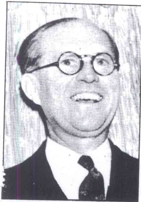
JOE KENNEDY SR. flaunted his extra-marital affairs, even trying to seduce the girls his sons were dating.