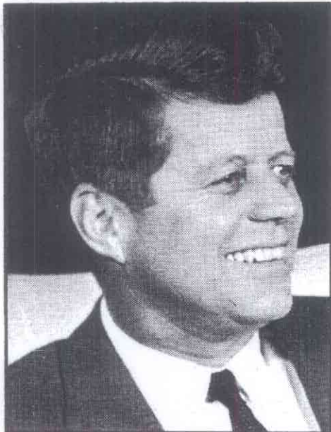
JFK'S love life just went on and on and...