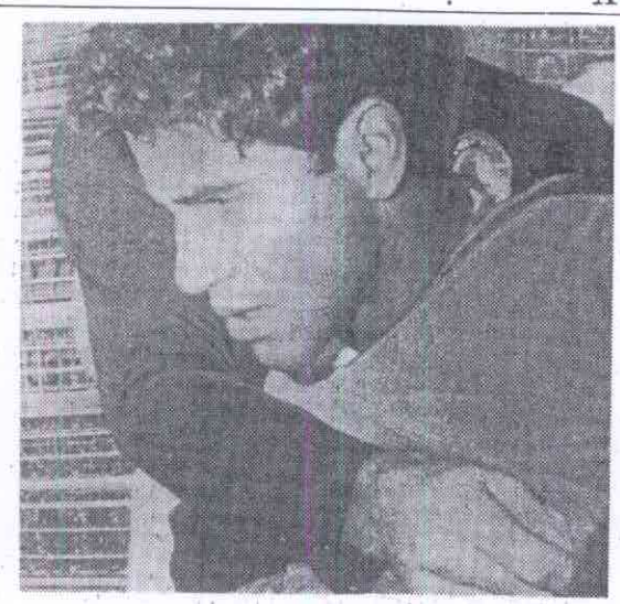
Sirhan Bishara Sirhan, the accused assassin of Sen. Kennedy, is held by captors moments after shooting.

What happened in those last decisive days to Sirhan Bishara Sirhan is now the task of American justice to discover.