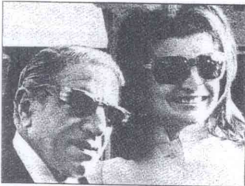
JACKIE did not find out about Jackie's injury until a year after their marriage