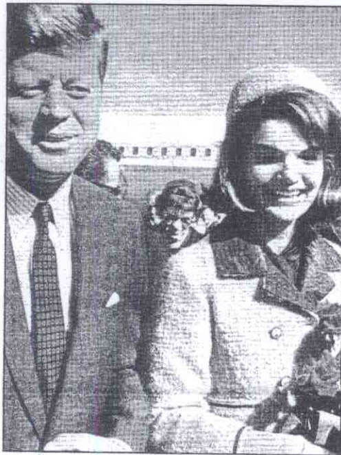
JFK AND JACKIE, photographed the day of the assassination, had no idea of what was to come