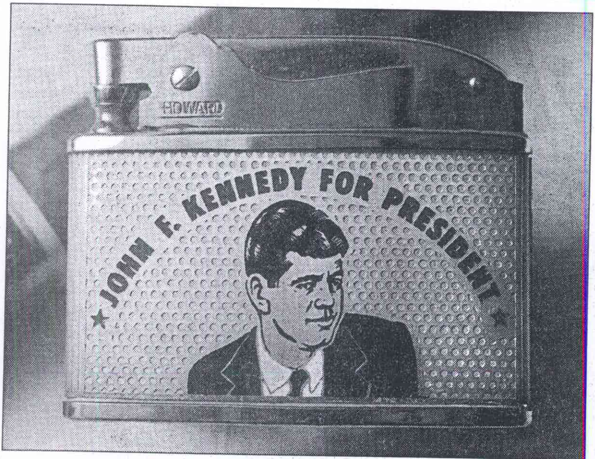
Among the Guernsey's auction items were a stainless steel cigarette lighter created for the 1960 presidential campaign and a 1930s travel diary kept by Kennedy's sister Kathleen, who died in a plane crash in 1948.