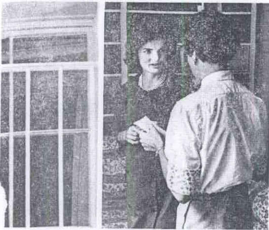
J ackie was reluctant to admit she had a full-time personal secretary. When a magazine did a picture story about her, Jackie told the writers she had only part-time help.