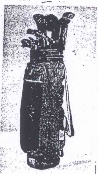
For auction from Jacqueline Kennedy Onassis's estate: A Van Cleef & Arpel emerald necklace and a set of President Kennedy's golf clubs.

in hardcover ($90). Both are to go on sale at Sotheby's in March.