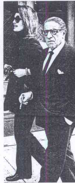
JACKIE & ARI in New York after she married the multibillionaire.

A Kennedy family insider told The ENQUIRER: "The Kennedys are shocked to the core over the