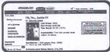
INTERNET PAGE promoting shocking new book.