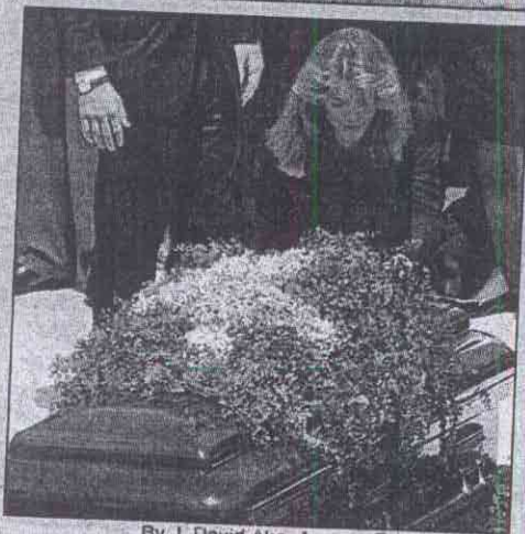
FAREWELL: Caroline Kennedy Schlossberg kneels at her mother's casket.