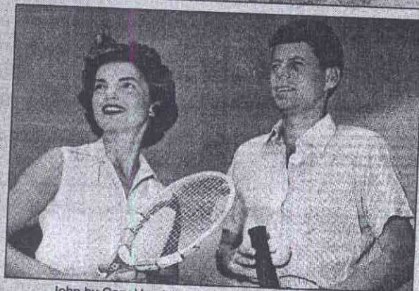
FATHER RECALLED, TOO: John Kennedy Jr. pauses to touch his father's gravestone after the burial service for his mother, top. Above, Jacqueline Bouvier posed in Hyannisport, Mass., with John F. Kennedy in 1953.