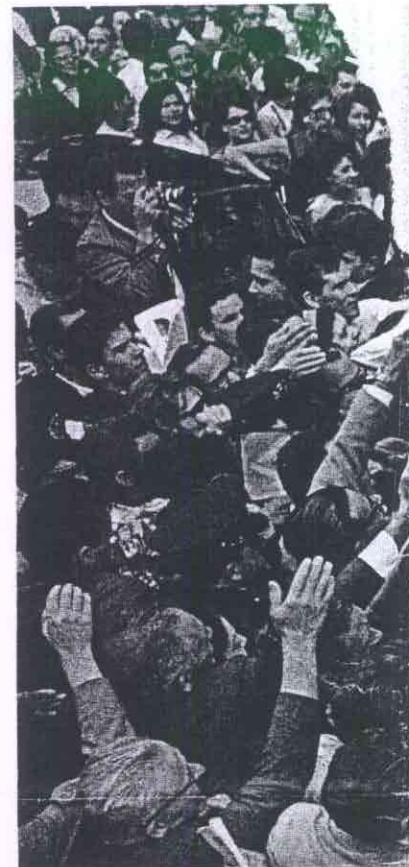
Surrounded by well-wishers and hemmed in by the curious, Sen.

Robert Kennedy runs for President every day. His recent Latin American trip was an illustration of that. Leaping onto cars, plunging into piranha-infested waters, the senator campaigned relentlessly in five countries—always with one eye on the newspapers back home.