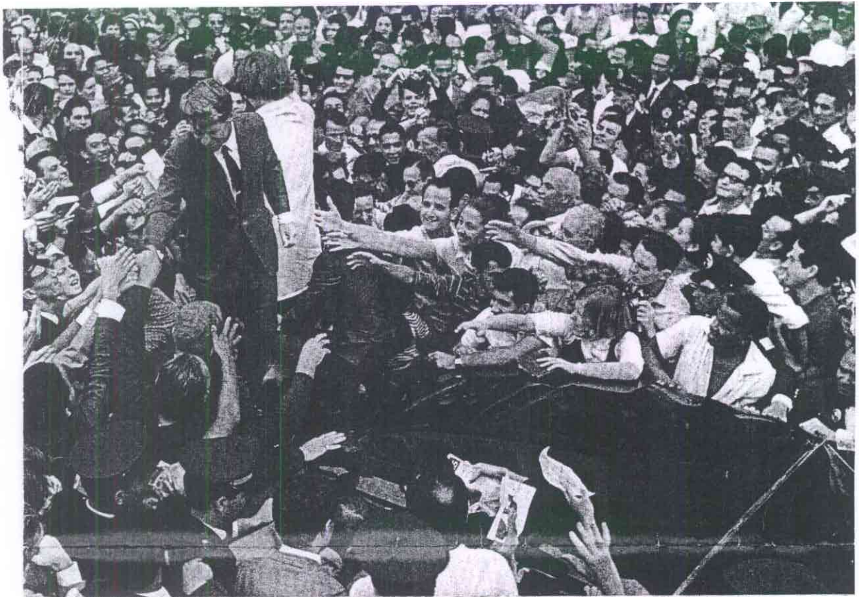
Robert F. Kennedy and his wife Ethel perch atop a limousine in their bogged-down motorcade in São Paulo. The Brazilians shouted "Presidente, Presidents," as they touched him.

Leaving Ethel behind in Lima, where she was to visit a series of schools and hospitals, Bobby took off in an unpressurized DC-4 for a flight over the mountains to Cuzco, Peru. It was obvious from the beginning that no embassy plans were going to stop him there.