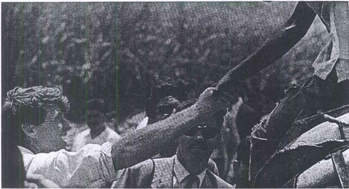
In the Brazilian sugarcane fields near Recife, where Kennedy heard tales of wage-gouging, he grasps the hand of a laborer on muleback. Man wearing a tie is Bobby's interpreter.