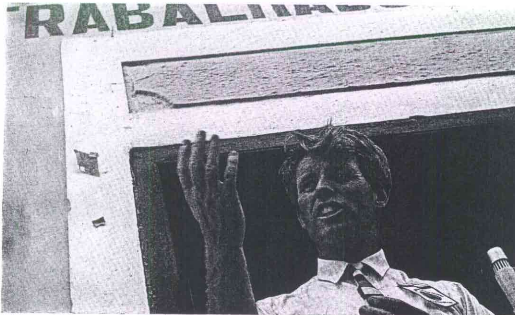
Gesturing expansively, Senator Kennedy addresses a crowd at a rural labor cooperative. Everywhere he went, Kennedy told how U.S. policy supports reform in Latin America.