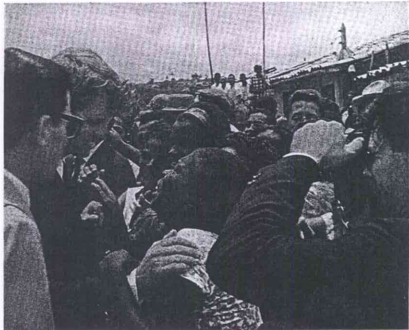
Poor Brazilians hang on Kennedy in Salvador. His party called trip their "all-expense sium tour of South America."

The rector of the university, a small and obviously timid man, knocked on the door soon after and was also admitted. He felt a visit by Kennedy would be most inadvisable. He said he could not be responsible for the senator's safety. Then came