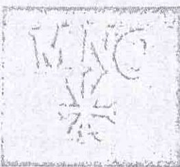
MNC Symbol ... key and machetes