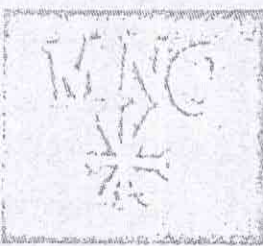
MNC Symbol ... key and machetes

in the hemisphere, according to Rosado , but the terrorism is carried out only by the MNC's Cuban exile members.