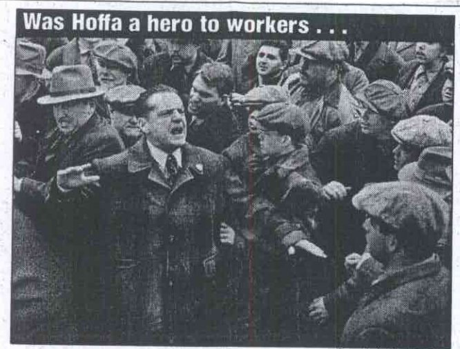
IN THE MOVIE: Jack Nicholson portrays Hoffa as a man dedicated to 'raising the standards of members of his union.'