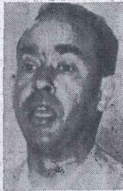
MEHDI BEN BARKA