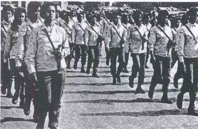
IN HAVANA — Castro's female army, indoctrinated to hate everything American, marches in review in Cuba's capital city. Soviet trained Cuban army units saluted Russian Lieutenant General Ivan Vishenko on 50th anniversary of Bolshevik Revolution. Pledged themselves to "liquidating Yankee imperialism."

party in Russia's Washington diplomatic headquarters.