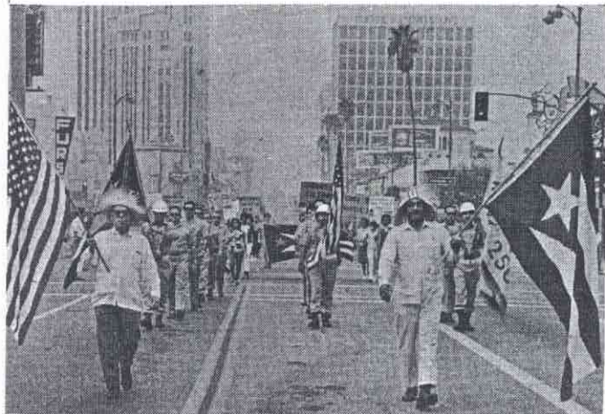
IN LOS ANGELES, CAL. — Veterans of the Bay of Pigs Brigade and other Cuban exiles march in support of Freedom's forces fighting in Vietnam. "The Worker," U.S. communist news organ, gleefully commented, "The Cubans marched almost alone."

There is something fishy going on between Cuba's "Maximum Leader" Fidel Castro and his Kremlin overseers. Communist Cuba's totally state-owned and operated press, which slavishly and exclusively follows the guidelines dictated by Castro, has been dramatically frigid during the last several weeks toward the Soviet Union's ruling oligarchy. The Cuban press has been far less enthusiastic over Soviet achievements and the "glorious Fiftieth Anniversary of the Bolshevik Revolution" than the ravingly pro-Soviet liberal press in the United States. In fact, Cuban press dispatches, monitored in Miami, indicate Prime Minister Castro was much cooler toward comrades Brezhnev and Kosygin at the official reception given by the Soviet Charge de Affaires to celebrate the "Fiftieth" than American Secretary of State Dean Rusk, when he enthusiastically toasted Moscow's Bolshevik regime at a cocktail