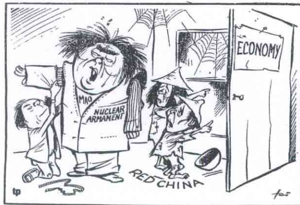
"What's more important: your bit of food or your father being presentable?"

The fire soon spread to other areas and some 3,000 houses were burned down, the sources added.