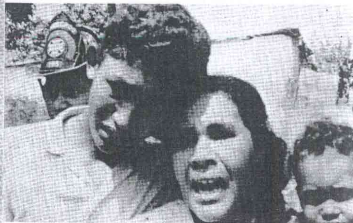
Dominican people feel Castro's fury.

Write INCA for information on Hitler in Havana! and other INCA FACTFILMS.