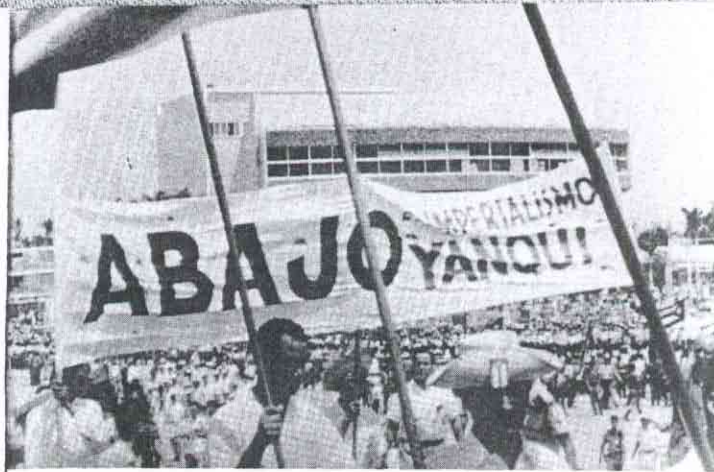
Cuban campesinos parade beneath slogan, "Down with Yankee Imperialism".