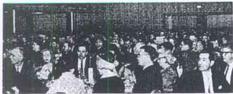
Tremendous turn-out at INCA Awards Dinner crammed Roosevelt's International Room.