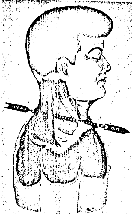
COMMISSION EXHIBIT 385