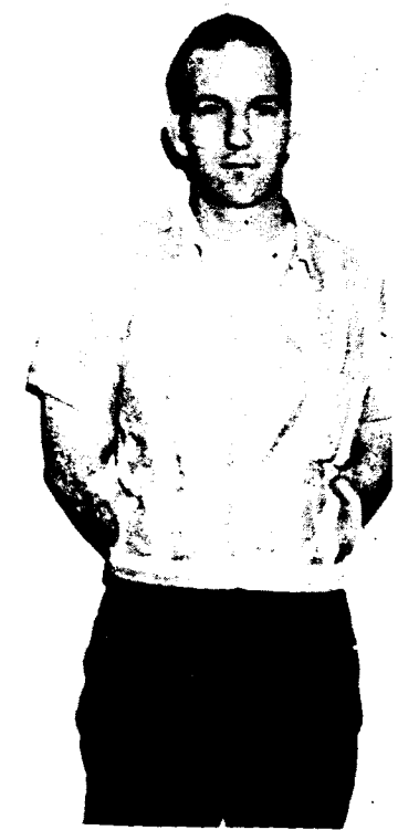
Shanevfelt Exhibit No. 24