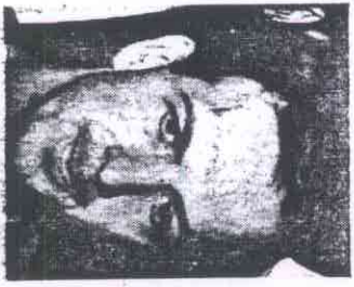
Was E. Howard Hunt (right) in Dallas that fatal day in 1963 to kill Lee Harvey Oswald (left) after the assassination?

Richard M. Helms, former CIA director, and James J. Angleton, former counterintelligence chief, initiated the memo, according to investigators who made the information available to the Sunday News Journal. According to sources close to the Select Committee on Assassination, the document reveals: