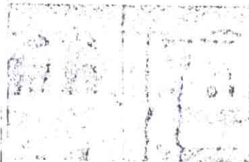
An enlargement from Hughes's film shows a figure in the window next to the assassin's.