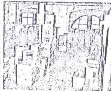
Dallas Police photo taken a short time after the assassination showing boxes in front of second window. It is evident that these boxes would not have appeared above the first lintel of the window from outside.