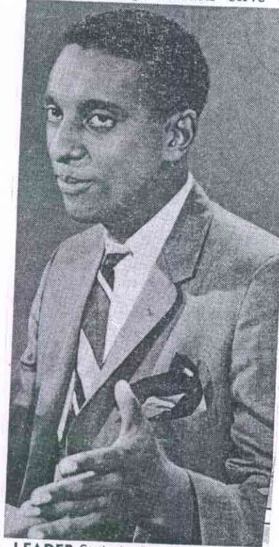
LEADER Stokely Carmichael talks of using any force necessary to attain objectives.