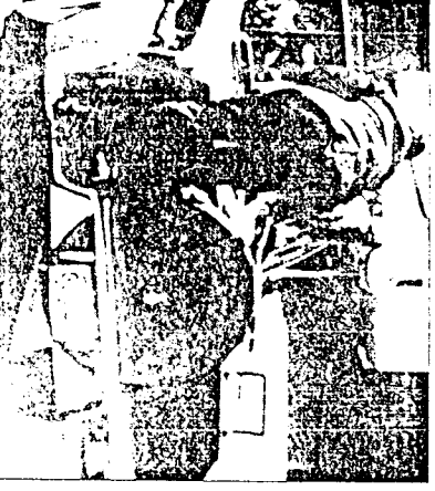
Secret service agent scrambles onto JFK's limo as wife dies; ve leans over the mortally wounded president