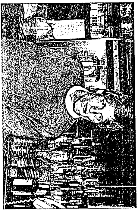
Cheers bartender Woody Harrelson has traveled a different path — to TV stardom

The three men were called "tramps" because, at first glance, they look shabbily dressed, like bums. But blow-ups of the pictures show that their shoes appear to be new and shiny and their clothes are