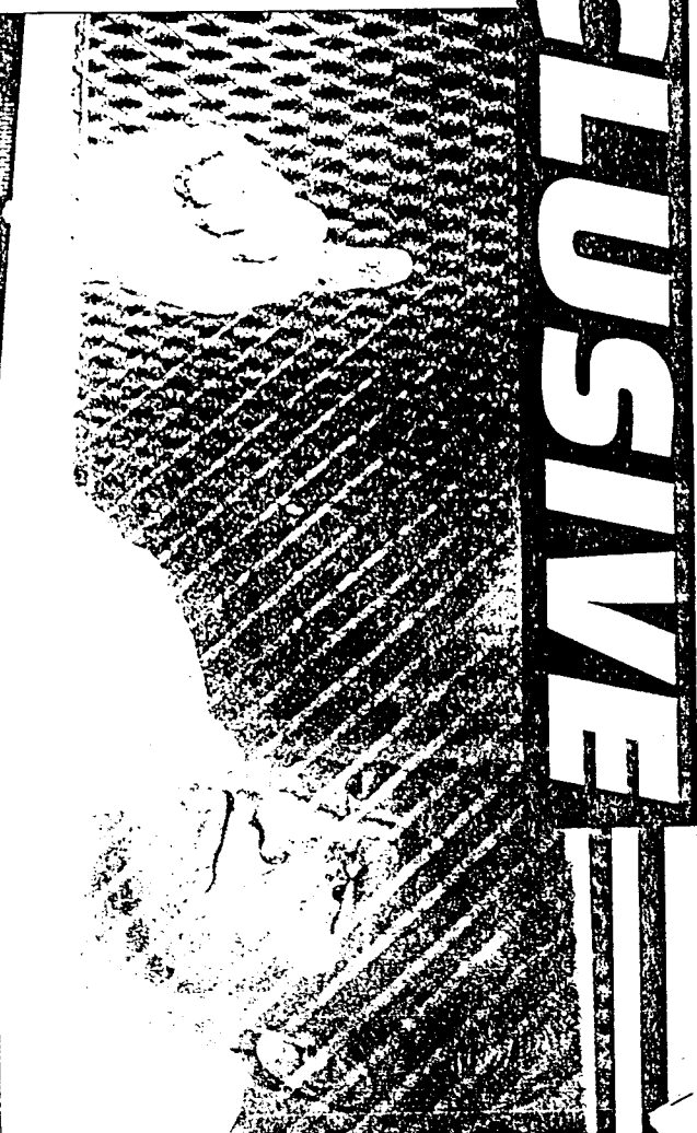
Charles Harrelson is currently serving three life sentences for his role in the murder of a Texas judge. He's eligible for parole in 1998