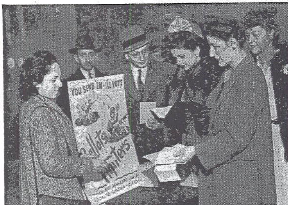
The Book and Magazine Union, Local 19, United Office and Professional Workers of America, CIO, lost no time trying to expedite ballots for New York State men and women in service. It set up a booth at 45th St. and Madison Ave. yesterday from which members distributed applications for war ballots. The applications must be signed by the serviceman and woman and sent to the State War Ballot Commission, part of the rignarole required under Gov. Dewey's involved GI-"can't-vote" law.

"It would be interesting for the American people to know whether or not Mr. Dewey is encouraging his Commissioners to deliberately issue directives calculated to injure our price-control program or whether he just doesn't know what is happening in his own state."