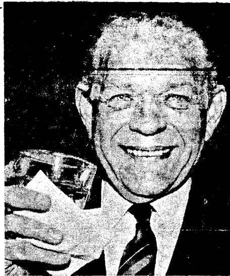
VICTORY SMILE: Clay Shaw prepares to toast triumph over Jim Garrison after being acquitted of conspiracy charges.