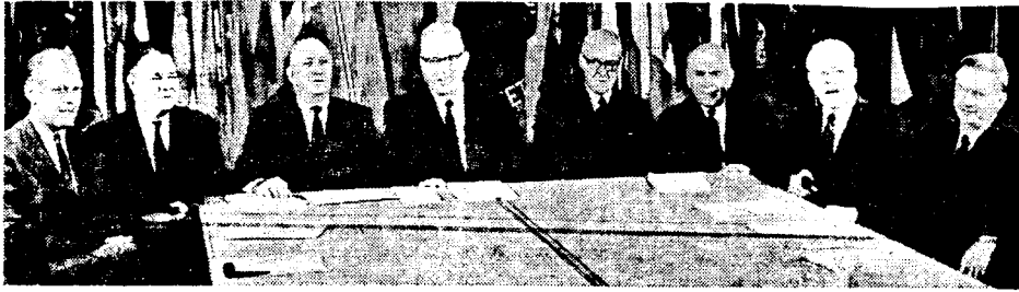
WARREN COMMISSION: (From left) Rep. Gerald Ford, Rep. Hale Boggs, Sen. Richard Russell, Supreme Court Chief Justice Warren, Sen. John Cooper, John McCloy and Allen Dulles, with counsel, J. Lee Rankin.