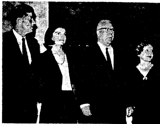
TWO DAYS LEFT: President Kennedy and wife Jackie pose with the Earl Warrens at a White House reception held Nov. 20, 1963.