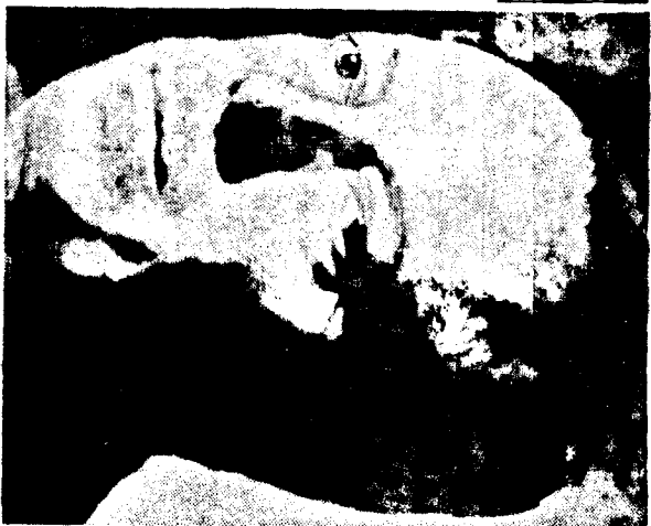
D.A. JIM GARRISON Blames military-industrial complex

"For my country's sake, I hope the truth will come out somewhere." Was President Kennedy really mur-