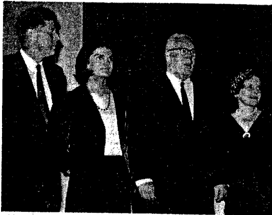
TWO DAYS LEFT: President Kennedy and wife Jackie pose with the Earl Warrens at a White House reception held Nov. 20, 1963.

18 years, or any special interest to the government intelligence forces which you have described?