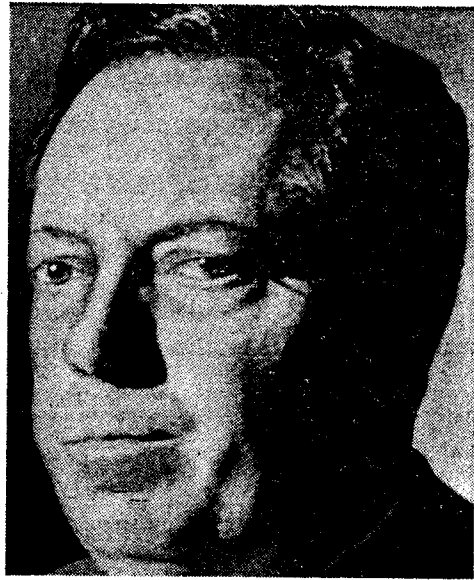
D.A. JIM GARRISON Blames military-industrial complex