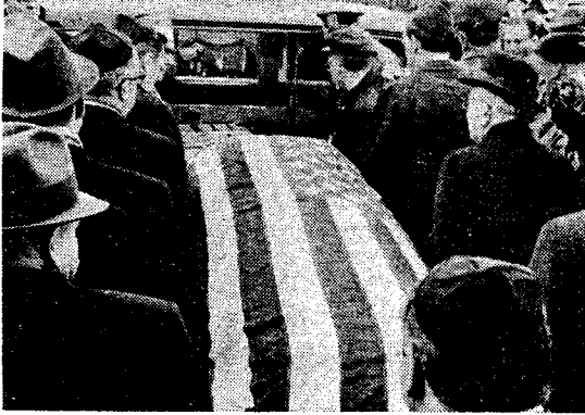
RUBY'S FUNERAL: Jack Ruby killed key assassination witness — Lee Oswald — but authorities let Ruby be buried in flag-draped coffin because of his Air Force service.

is possible to have the truth about the assassination printed.