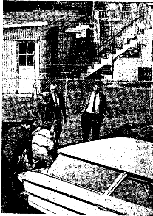
DEAD WITNESS: Body of Dave Ferrie, close associate of Lee Oswald, is carried from his home by police officers.

A. For a long time, I have tried to communi-