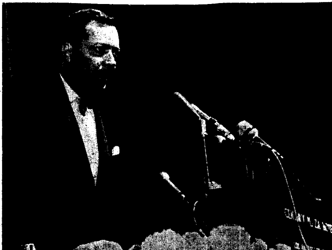
New Orleans' District Attorney Jim Garrison spoke Tuesday night at Century Plaza Hotel about his Kennedy Assassination probe.