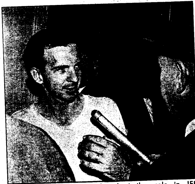
LEE HARVEY OSWALD played similar role in JFK assassination