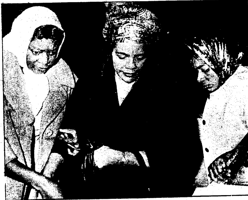
WIDOW of Martin Luther King pays last respects at funeral