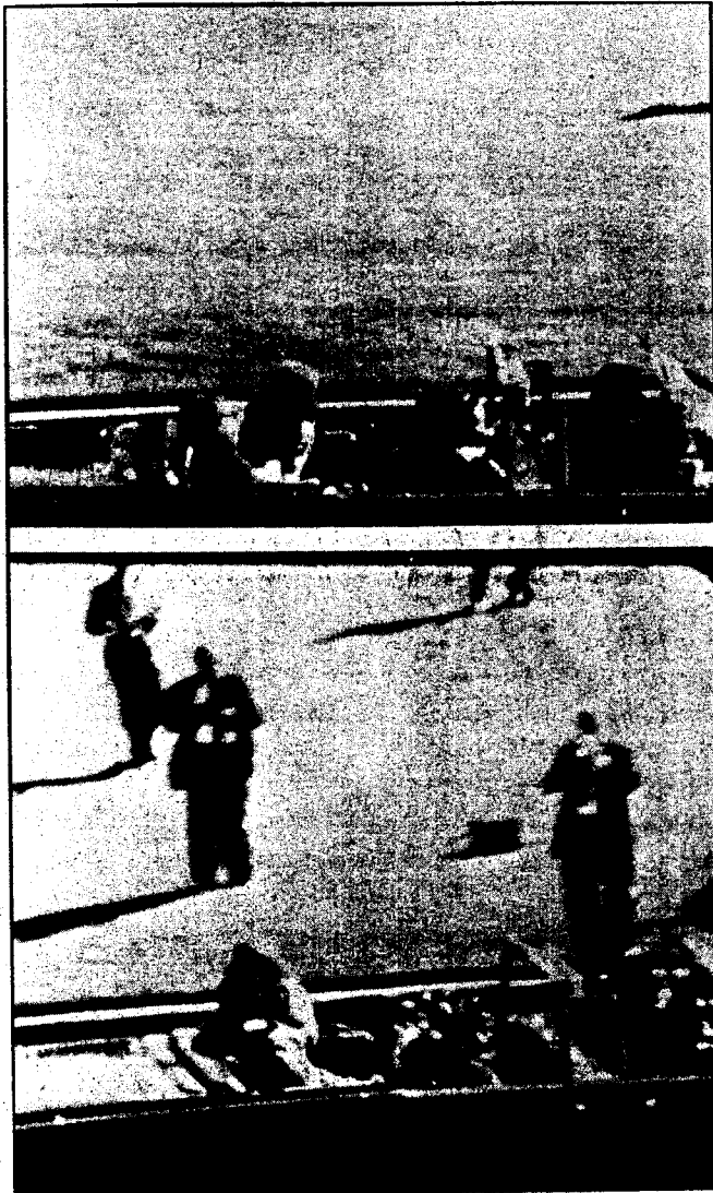
JFK ASSASSINATION took place under similar mysterious circumstances

"There is one line of thought that James Earl Ray