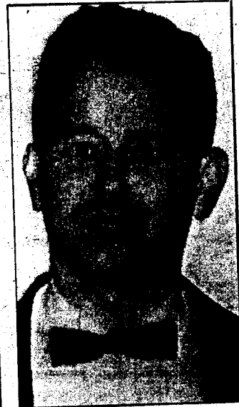
ERIC STARVO GALT (police drawing at left) was later identified as James Earle Ray, (right) an escaped convict

"At that point he would have been picked up by another car and driven to an airstrip, flown out of the state, and probably out of the country.