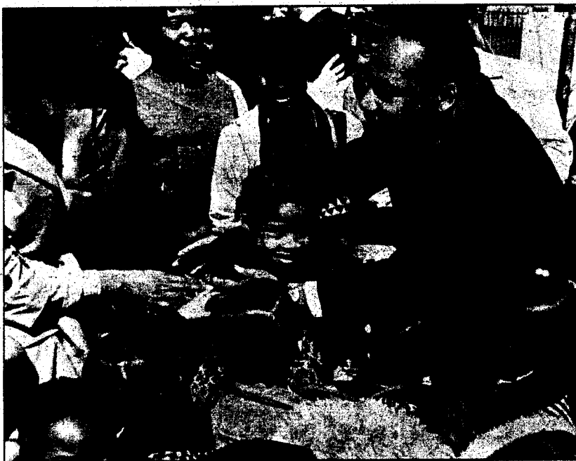
MARTIN LUTHER KING preached love between whites and negroes