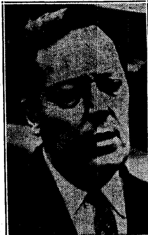
Jim Garrison He silenced the scoffers

arguments to his assistants while he sat back puffing his pipe as if such dull distractions were beneath his notice. His assistants at least knew their law and handled themselves with dignity. The DA did not even stay to watch over his witnesses while they were being cross-examined.