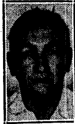
David W. Ferrie

"The apparent suicide of David Ferrie ends the life of a man who, in my judgment, was one of history's most important individuals," Garrison said.