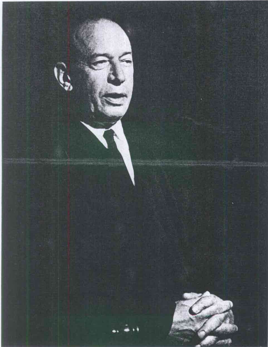
Associate Justice Abe Fortas: Why would a man of his legal brilliance and high position do business with . . .