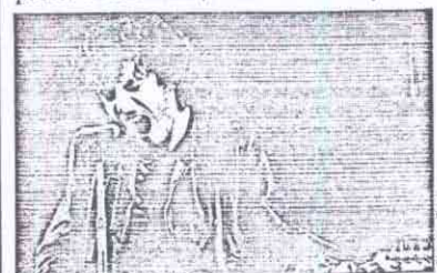
Bruce Springsteen: born to run from the press.

Two years after a media-hype overkill that threatened to destroy his rock career before it developed, Bruce Springsteen still keeps himself secluded from the press. Meanwhile, back in New Jersey,