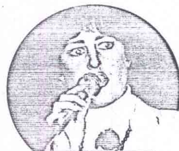
Grace Slick: skywriting her bio about Airplane and Starship.