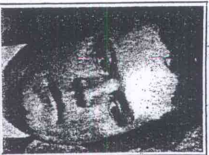
Porn king Flynt (above) and his L.A. FREE PRESS (left), which printed the truth about Kennedy's death.